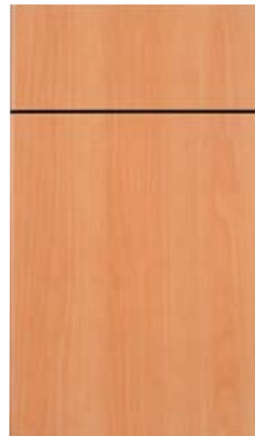
Prescott Laminate Door Style with Natural Pear laminate