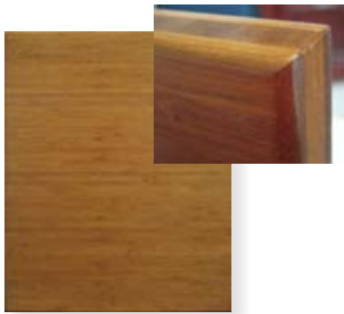
Staten Island 3-Ply Bamboo Door Style, shown with eased edge option, finished in Nutmeg stain

In addition to doors featured, we have several other green choices available.