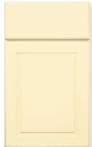
Stratus Square MDF Door Style with Chiffon paint