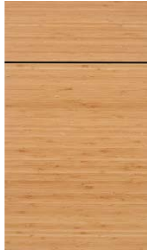
Manhattan Door Style with horizontal engineered veneer carbonized bamboo