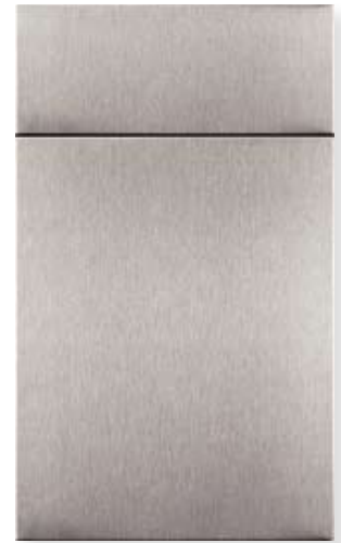
Stainless Steel Door